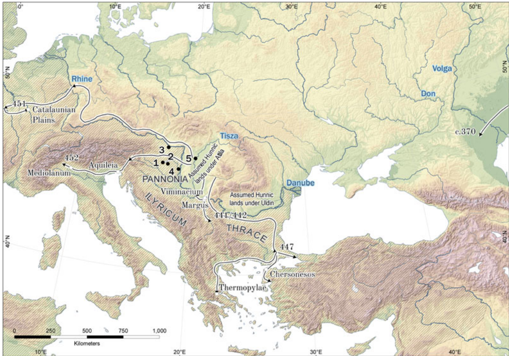
Fig. 1. Historically recorded locations of Hunnic activity. The arrows indicate the assumed routes of the main Hunnic raids. Sites sampled for isotope analysis in Hakenbeck et al. 2017: 1. Keszthely-Fenépuszta; 2. Hács-Béndekpuszta; 3. Győr-Széchenyi Square; 4. Mőzs; 5. Szolnok-Szanda. Shaded area: Roman Empire. Roman provinces map data adapted from the Ancient World Mapping Centre (Creative Commons Attribution-NonCommercial 3.0 Unported); coastline and river data from Natural Earth ( https://www.naturalearthdata.com ); elevation data from the GMTED2010 (Danielson and Gesch 2011). (Map created by David Redhouse.)

by the dreadful rumors noised abroad concerning him.” 13 By their appearance and behavior, the Huns seemed in every way opposed to Roman civilization. This negative image was perpetuated in historical scholarship and has persisted in the popular imagination up to the present day. 14