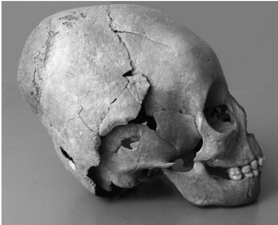
Fig. 3. A modified skull of a child, unknown provenance.

and elongate the parietal bone. When the bones are fused, this shape remains a permanent feature of a person's appearance. The practice first arose west of the Tian Shan mountains in the 2nd c. BCE, spreading westwards to the northern Black Sea region at the turn of the millennium and reaching central Europe by the 5th c. CE. However, the practice is not typical for the burial complexes of Mongolia that have been associated with the Xiongnu. In central Asia, burial of individuals with modified skulls was very diverse, and it cannot be associated with any distinct